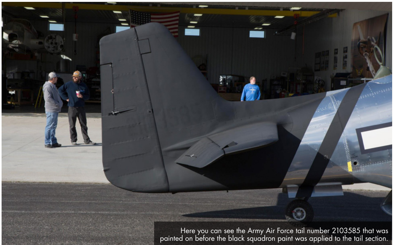
Here you can see the Army Air Force tail number 2103585 that was painted on before the black squadron paint was applied to the tail section.