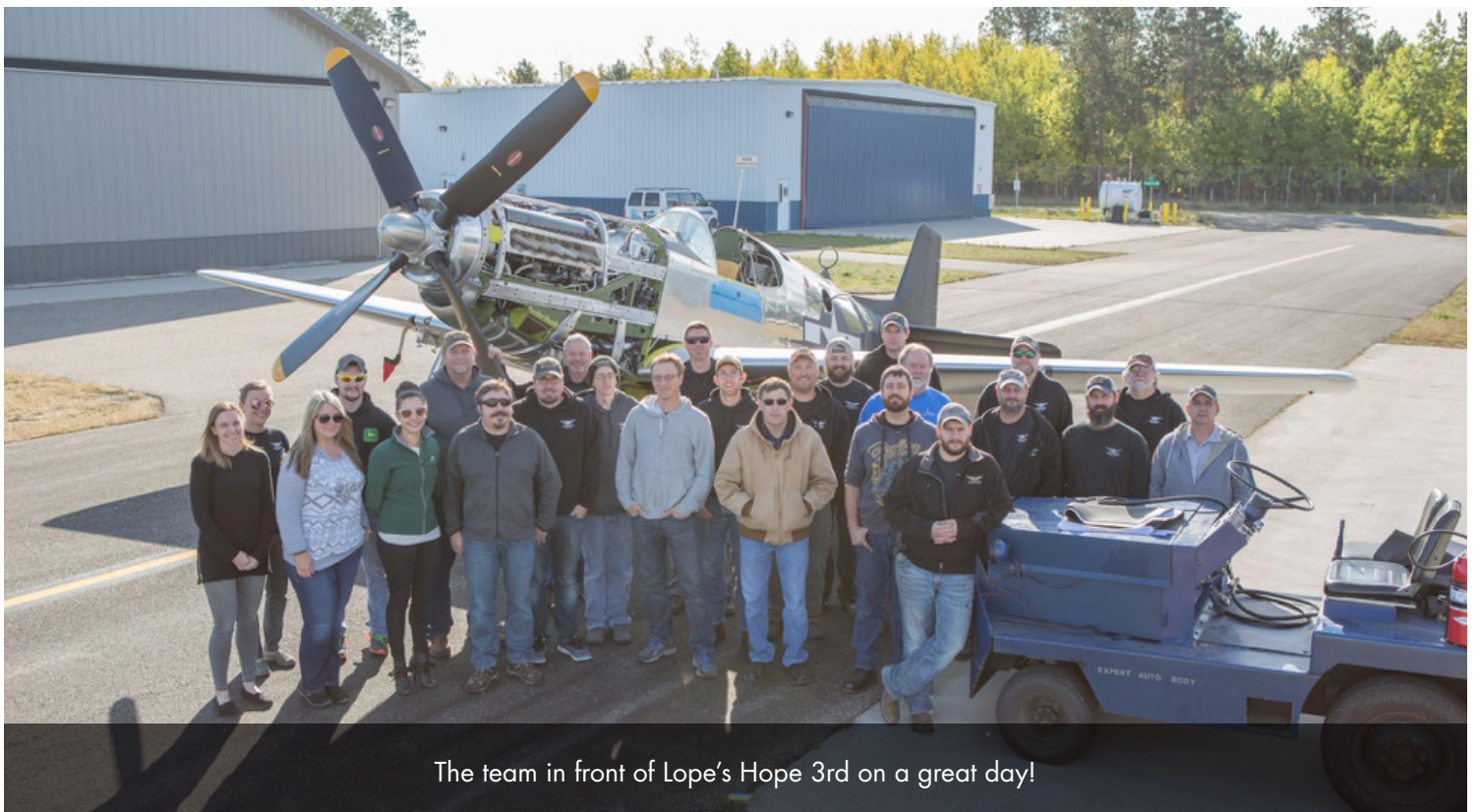
The team in front of Lope's Hope 3rd on a great day!