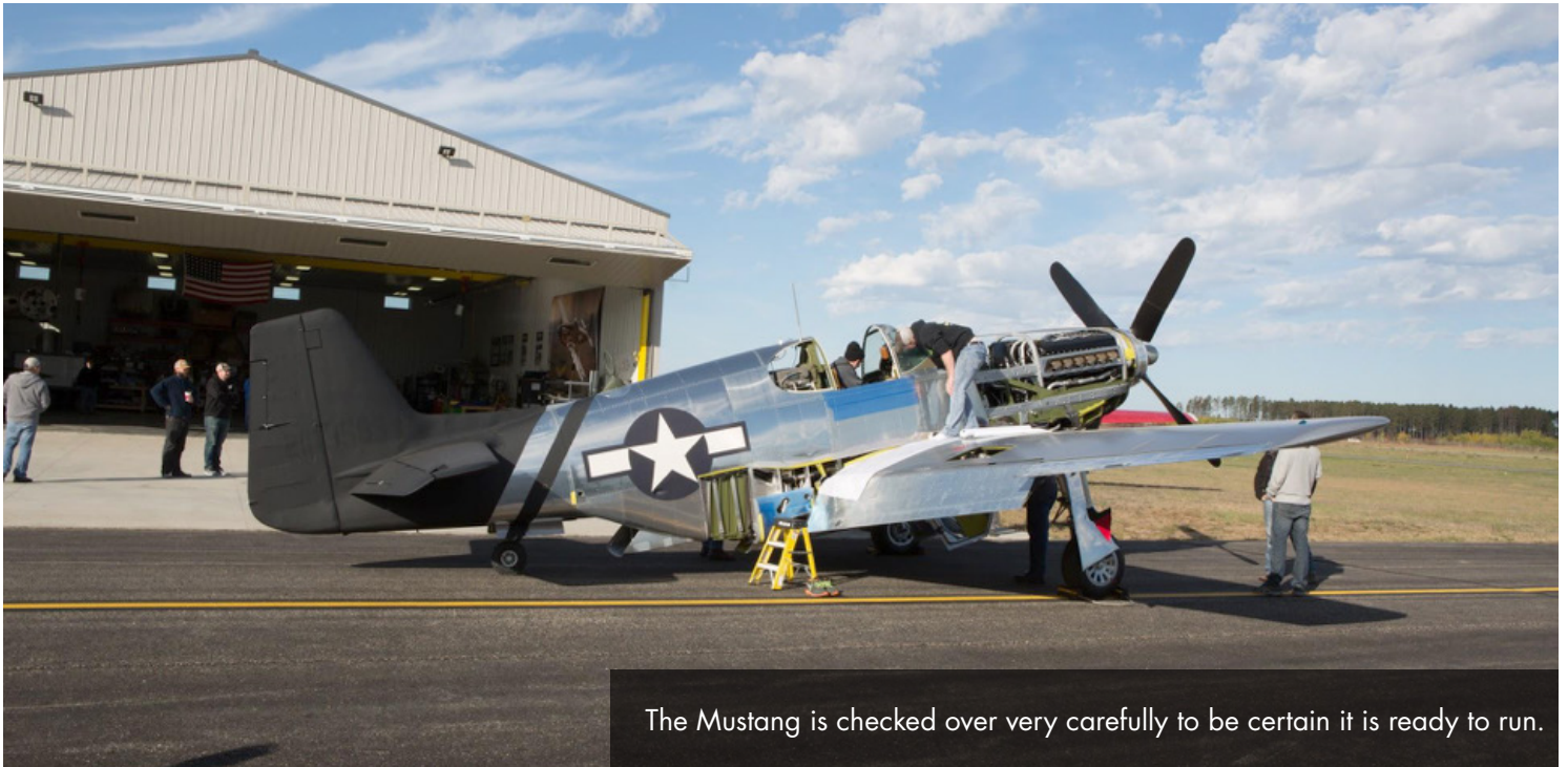
The Mustang is checked over very carefully to be certain it is ready to run.