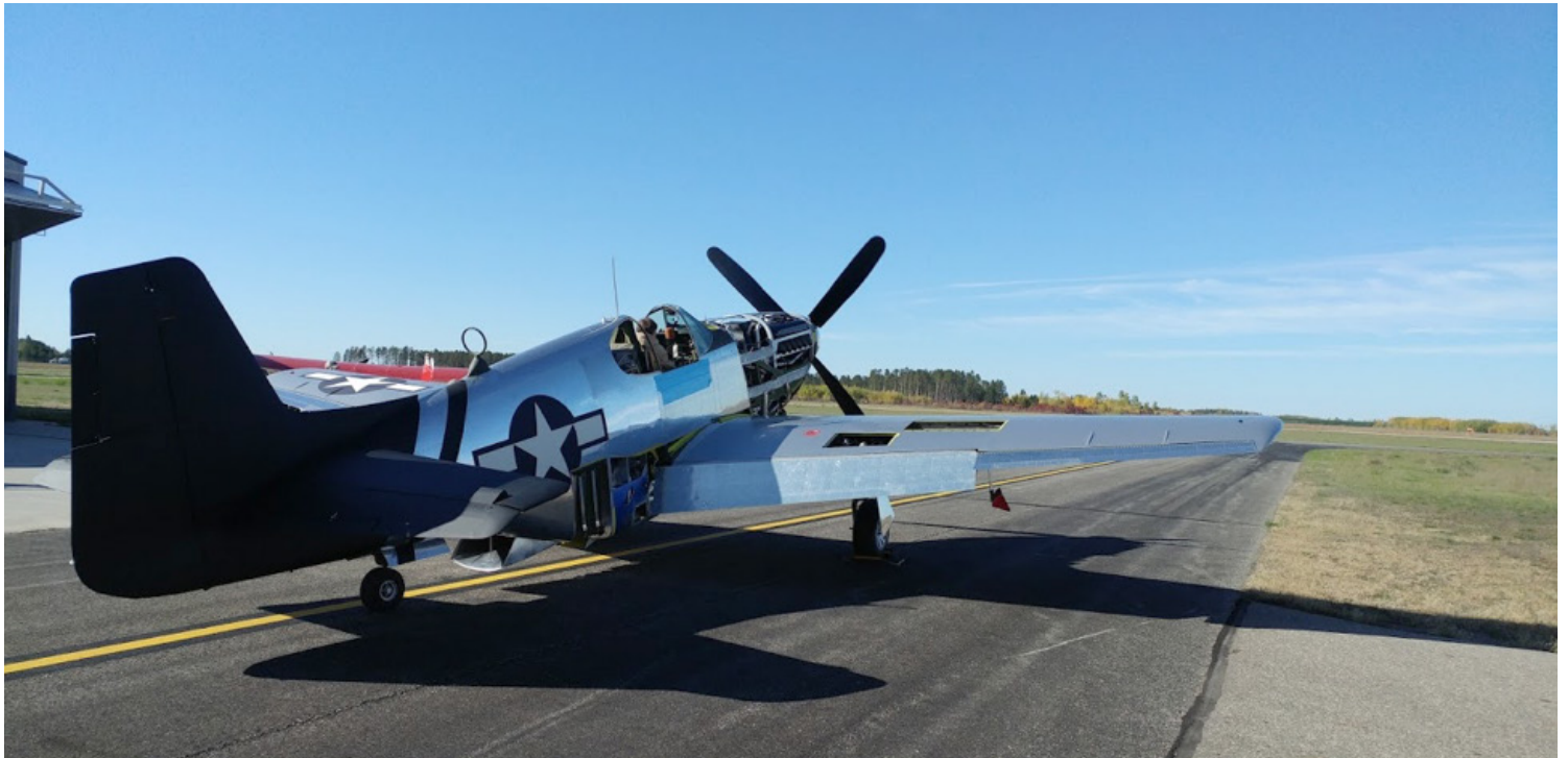
The sound, sight, and smell of a Merlin running is truly a visceral experience - especially for everyone who loves warbirds. We can't wait for the test flight!