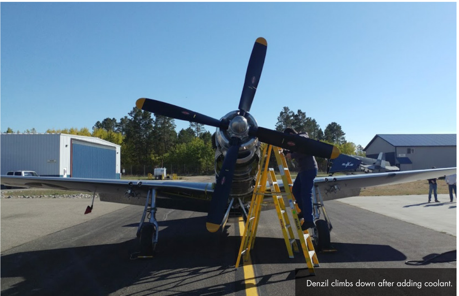
Denzil climbs down after adding coolant.